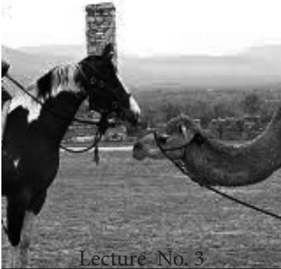
Lecture No. 3